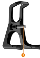
1 STAINLESS STEEL AXLE