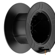
2 FOLDABLE HANDLE