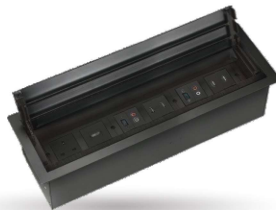
▲ STS-150D/3 B