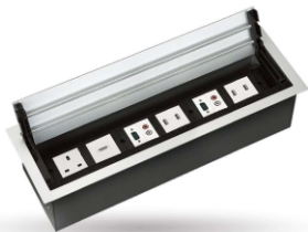
▲ STS-150D/3 S