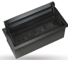
▲ STS-150D/2 B