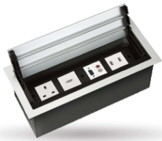
▲ STS-150D/2 S